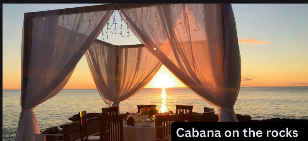
Cabana on the rocks